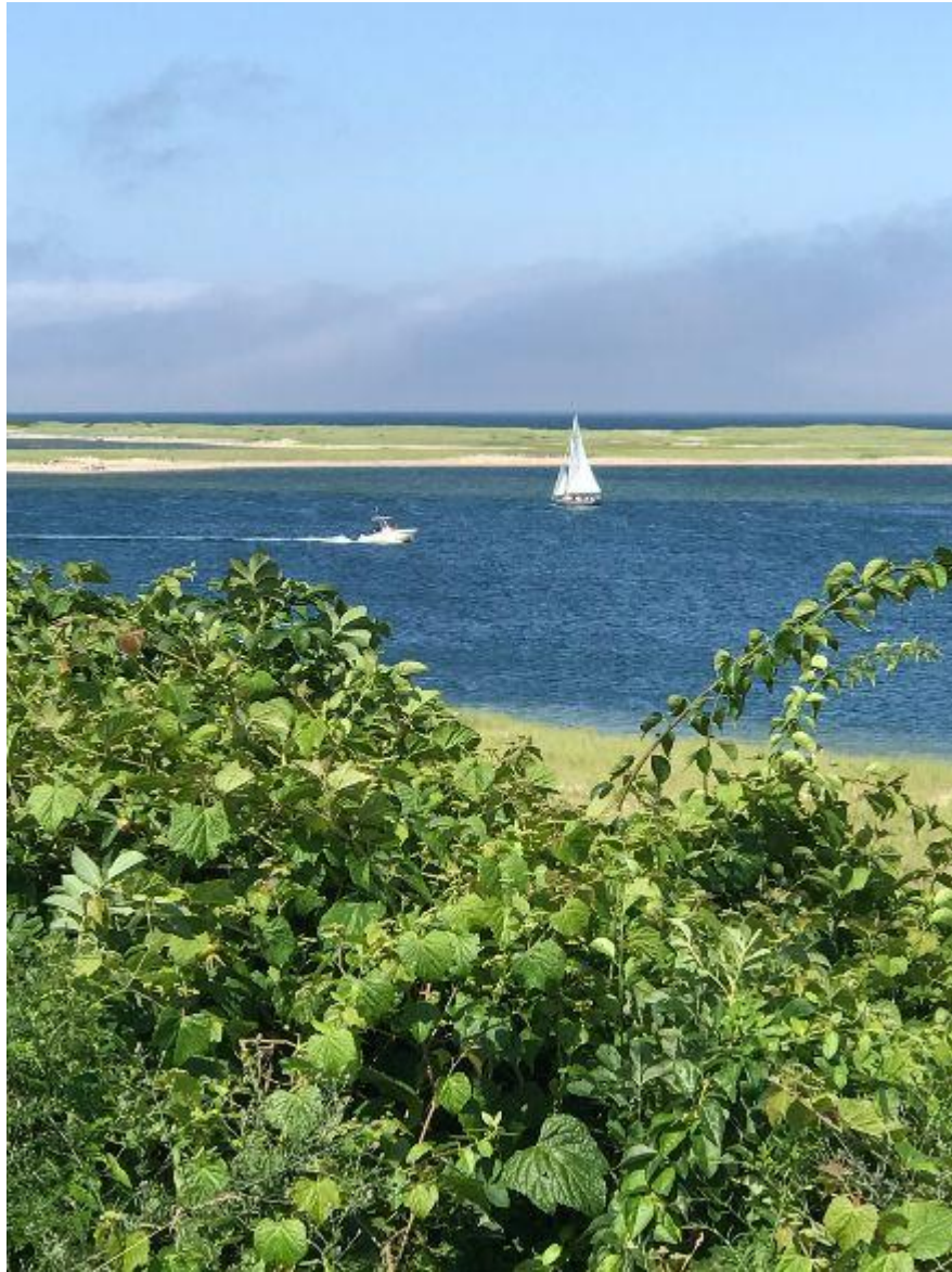
Summer Day in Chatham