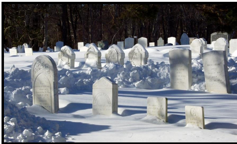
Snow White on White Stones

Land records are available at the county level. The Archives recently obtained the Massachusetts National Guard Archives, and so now records from the colonial period up to 1940 and beyond are available for such data as enlistment papers, muster rolls, and correspondence.