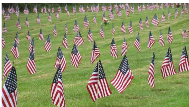
Massachusetts National Cemetery, Bourne Memorial Day 2011

Walter (16 at heart) ( wmgenealogy@gmail.com )